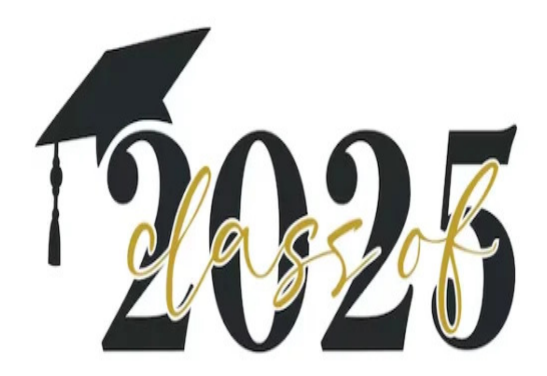
St. Paul Lutheran Church Ida Grove, Iowa Graduation Recognition May 4, 2025

<sup>153</sup>Look on my affliction and deliver me, for I do not forget your law. <sup>154</sup>Plead my cause and redeem me; give me life according to your promise! <sup>155</sup>Salvation is far from the wicked, for they do not seek your statutes. <sup>156</sup>Great is your mercy, O LORD; give me life according to your just decrees. <sup>157</sup>Many are my persecutors and my adversaries, but I do not swerve from your testimonies. <sup>158</sup>I look at the faithless with disgust, because they do not keep your commands. <sup>159</sup>Consider how I love your precepts! Give me life according to your steadfast love. <sup>160</sup>The sum of your word is truth, and every one of your just and righteous decrees endures forever.